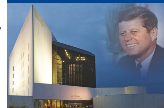
JFK Library & Museum