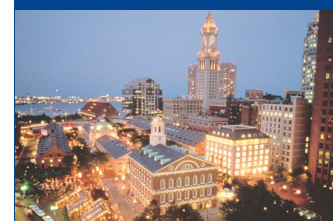
Faneuil Hall Marketplace

$75 Due Upon Signing. *Price per person, based on double occupancy. Add $124 for single occupancy. Final Payment Due: 5/31/2026