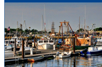
Historic Gloucester "America's Oldest Seaport"