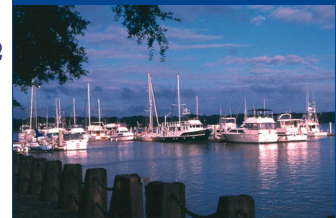
Beaufort, SC - "Queen of the Carolina Sea Islands"