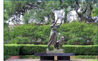
Savannah - the "Belle of Georgia"

Day 7: Today, after enjoying a Continental Breakfast, you will depart for home... a perfect time to chat with your friends about all the fun things you've done, the great sights you've seen, and where your next group trip will take you!