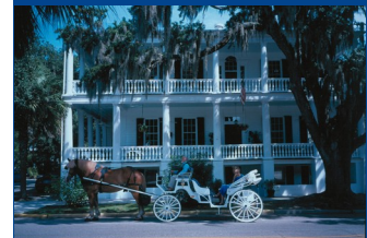
You'll feel like you've traveled back in time!

$75 Due Upon Signing. *Price per person, based on double occupancy. Add $274 for single occupancy. Final Payment Due: 3/10/2026