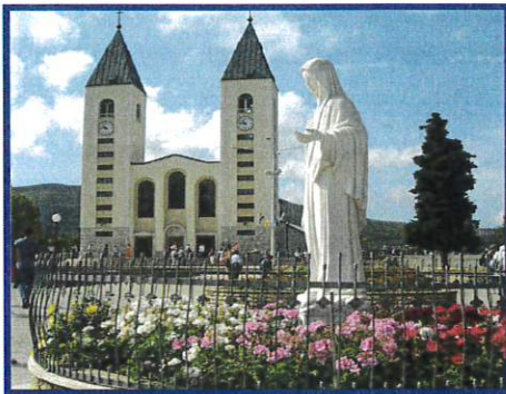
Church of St. James, Medjugorje