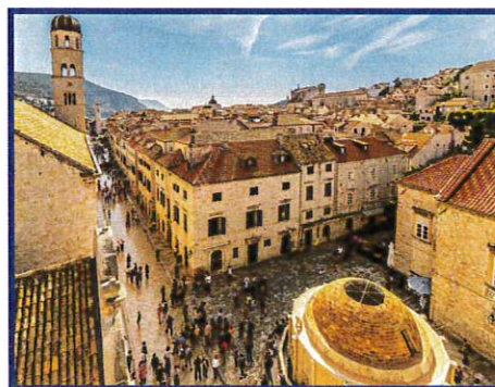
Old City and Fortress, Dubrovnik