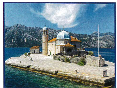
Our Lady of the Rocks Perast, Montenegro