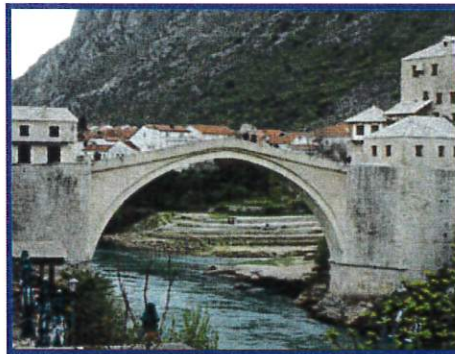
Mostar Bridge, Mostar